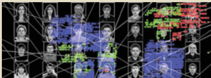
Multimedia performance "The Death of Tarelkin".

For the project curator Alexandra Dementyeva , as well as for the artists of the Open School "Manege/ Media Art Lab" , Death of Tarelkin production engages in a dialogue first of all with the legendary one of 1922 by Vsevolod Meyerhold. Meyerhold interpreted the grotesque comedy as a modernist story — about a transformation of a person into a screw or a small wheel of red tape bureaucratic machine. Creators of today's production, by transferring the action into today's (or tomorrow's) day, offer audience a chance to meet an updated modification of bureaucratic machine. Thanks to the newest technologies their authority over human being is invisible, ubiquitous and nocturnal. While a human being out of a screw or a wheel turns into a database, which can be copied, transferred, and used at one's discretion. Overall, there is no surprise that Kandid Tarelkin in the new production resurrects as a character resembling Edward Snowden.