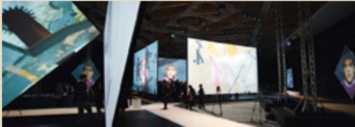
Peter Greenaway, Saskia Boddeke "Golden age of Russian Avant-garde". MEC "Manege", 2014