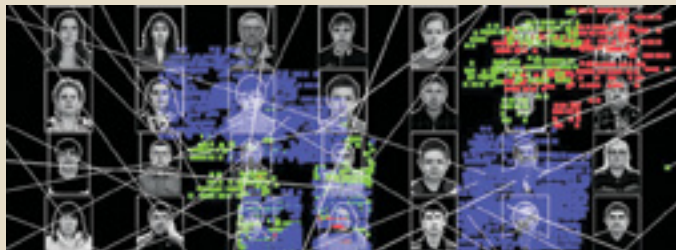
Multimedia performance "The Death of Tarelkin".

For the project curator Alexandra Dementyeva , as well as for the artists of the Open School "Manege/ Media Art Lab" , Death of Tarelkin production engages in a dialogue first of all with the legendary one of 1922 by Vsevolod Meyerhold. Meyerhold interpreted the grotesque comedy as a modernist story — about a transformation of a person into a screw or a small wheel of red tape bureaucratic machine. Creators of today's production, by transferring the action into today's (or tomorrow's) day, offer audience a chance to meet an updated modification of bureaucratic machine. Thanks to the newest technologies their authority over human being is invisible, ubiquitous and noctidial. While a human being out of a screw or a wheel turns into a database, which can be copied, transferred, and used at one's discretion. Overall, there is no surprise that Kandid Tarelkin in the new production resurrects as a character resembling Edward Snowden.